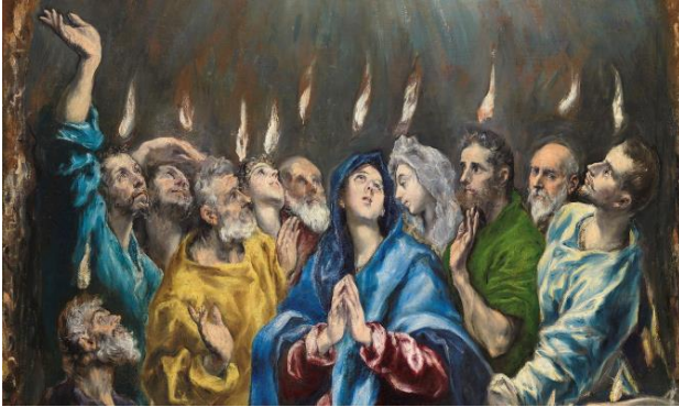
'Pentecost' by El Greco (1596-1599), The Prado, Madrid.

Send your Holy Spirit upon us and clothe your people with power from on high, alleluia.