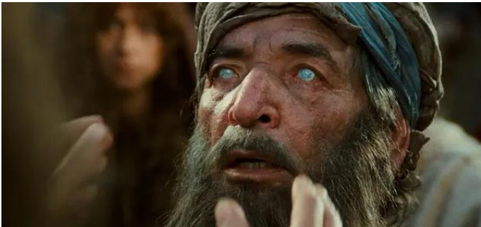
Bartimaeus receives his sight