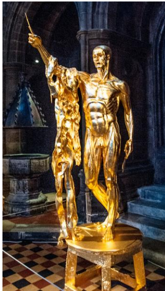
'Exquisite Pain' (2006) by Damien Hirst in St Bartholomew the Great Church, Smithfield, London